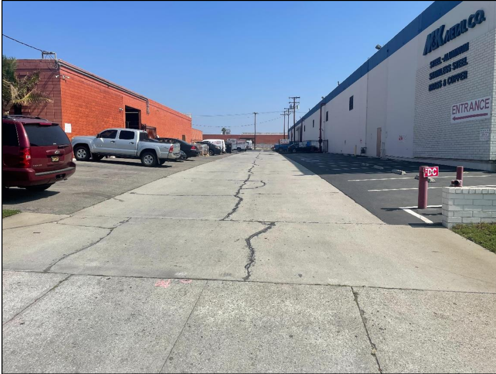
5. View of shared driveway with northerly adjacent property on Figueroa Street

Site Address: 14400 S. Figueroa St. & 400 Rosecrans Ave., Gardena, CA 90248