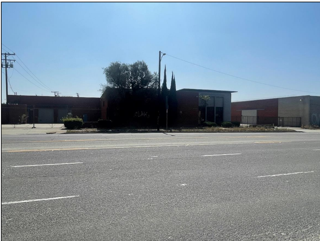
12. View of Project Site from Rosecrans Avenue (building to be demolished)