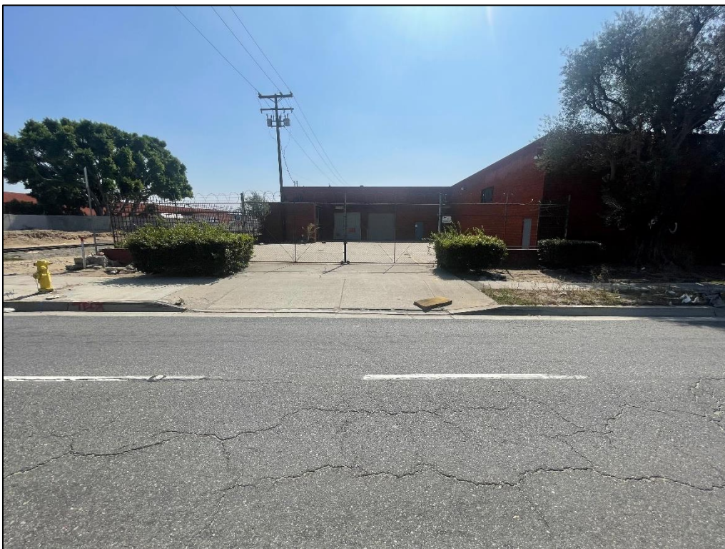
16. View of existing east driveway on Rosecrans Avenue (to be closed)