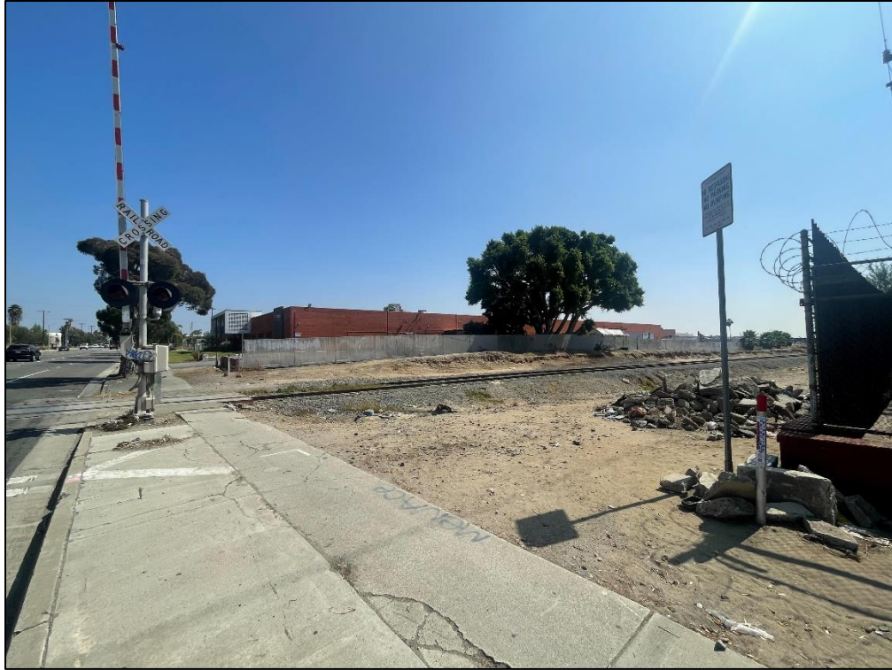
15. View of easterly adjacent railroad tracks on Rosecrans Avenue

Site Address: 14400 S. Figueroa St. & 400 Rosecrans Ave., Gardena, CA 90248