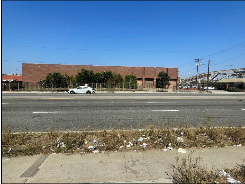
17. View of properties across Rosecrans Avenue from Project Site

Site Address: 14400 S. Figueroa St. & 400 Rosecrans Ave., Gardena, CA 90248