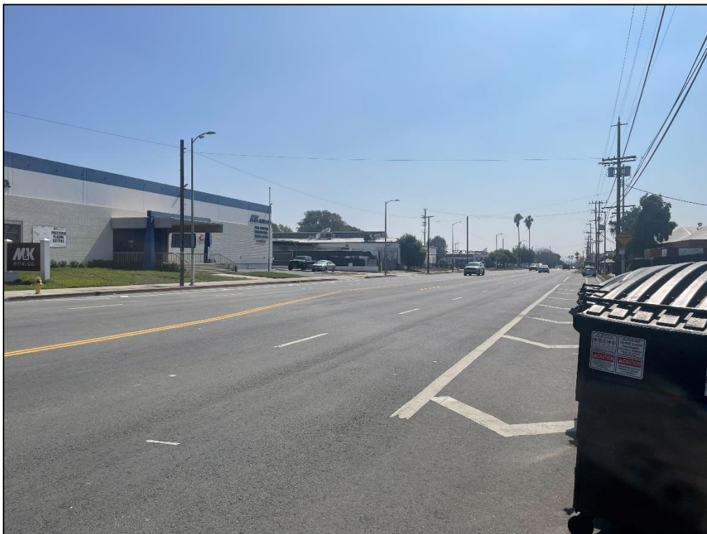
2. Facing south along Figueroa Street