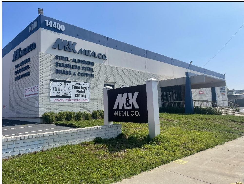
6. View of existing building frontage on Figueroa Street