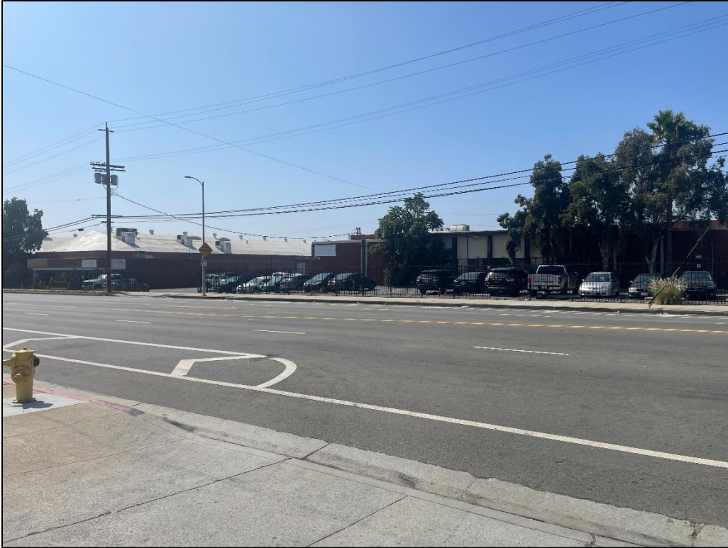
7. View of properties across Figueroa Street from Project Site

Site Address: 14400 S. Figueroa St. & 400 Rosecrans Ave., Gardena, CA 90248