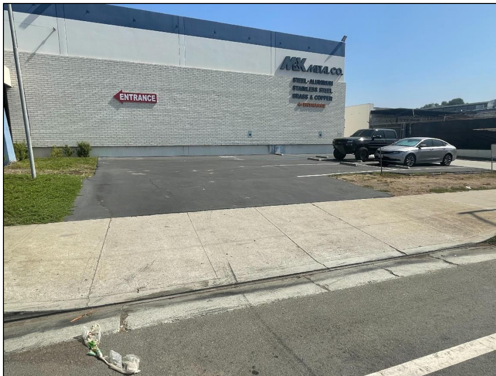
10. View of existing driveway and surface parking area on Figueroa Street