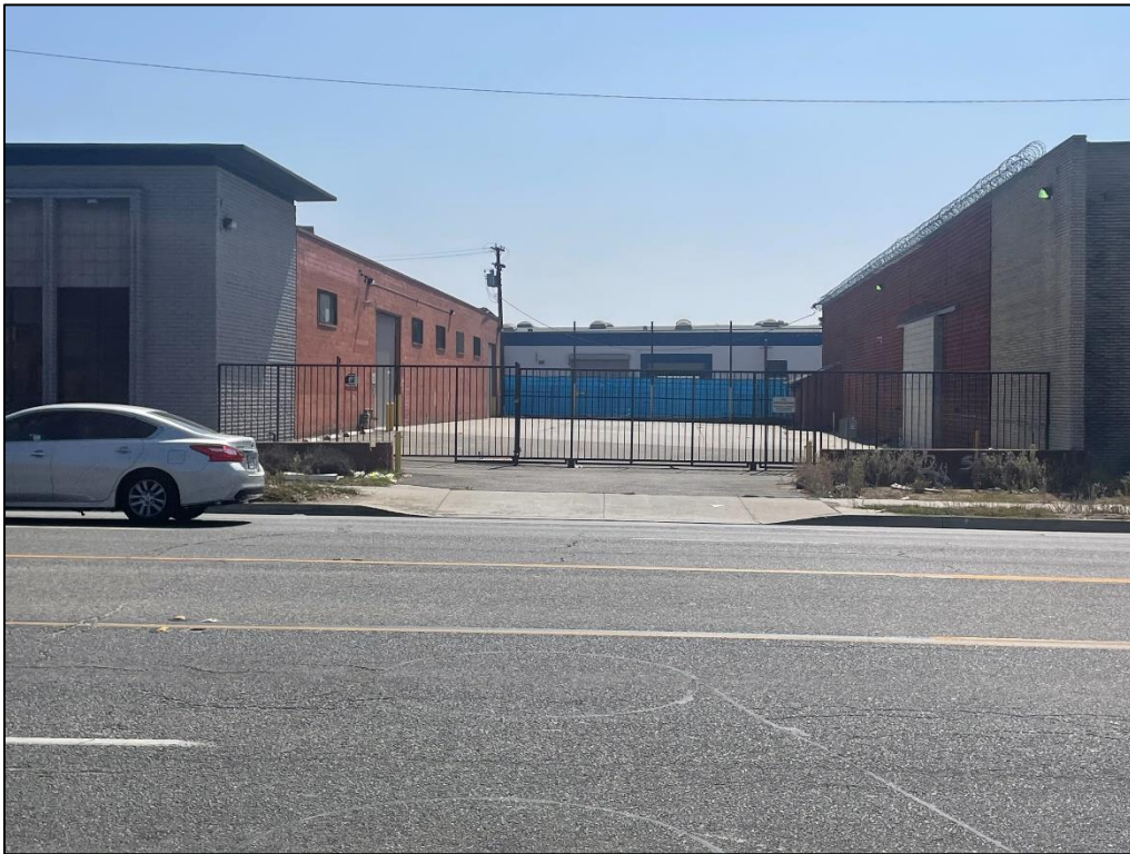
18. View of existing west driveway on Rosecrans Avenue