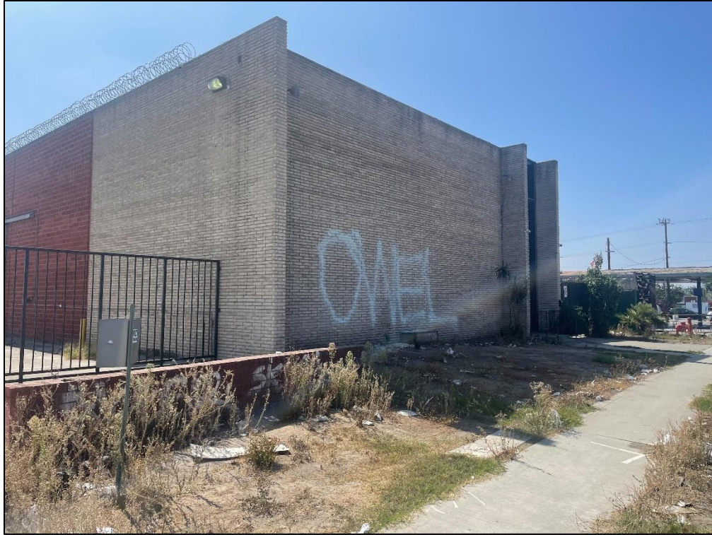
19. View of westerly adjacent property on Rosecrans Avenue

Site Address: 14400 S. Figueroa St. & 400 Rosecrans Ave., Gardena, CA 90248