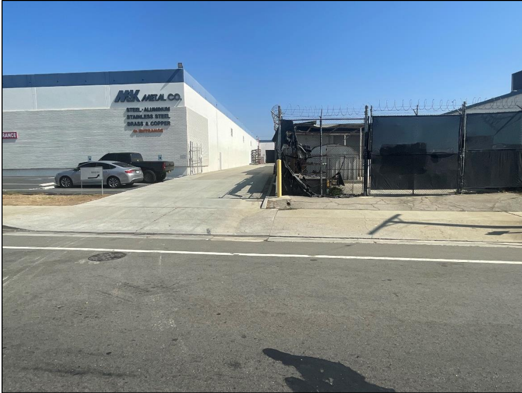
9. View of shared driveway with southerly adjacent property on Figueroa Street

Site Address: 14400 S. Figueroa St. & 400 Rosecrans Ave., Gardena, CA 90248