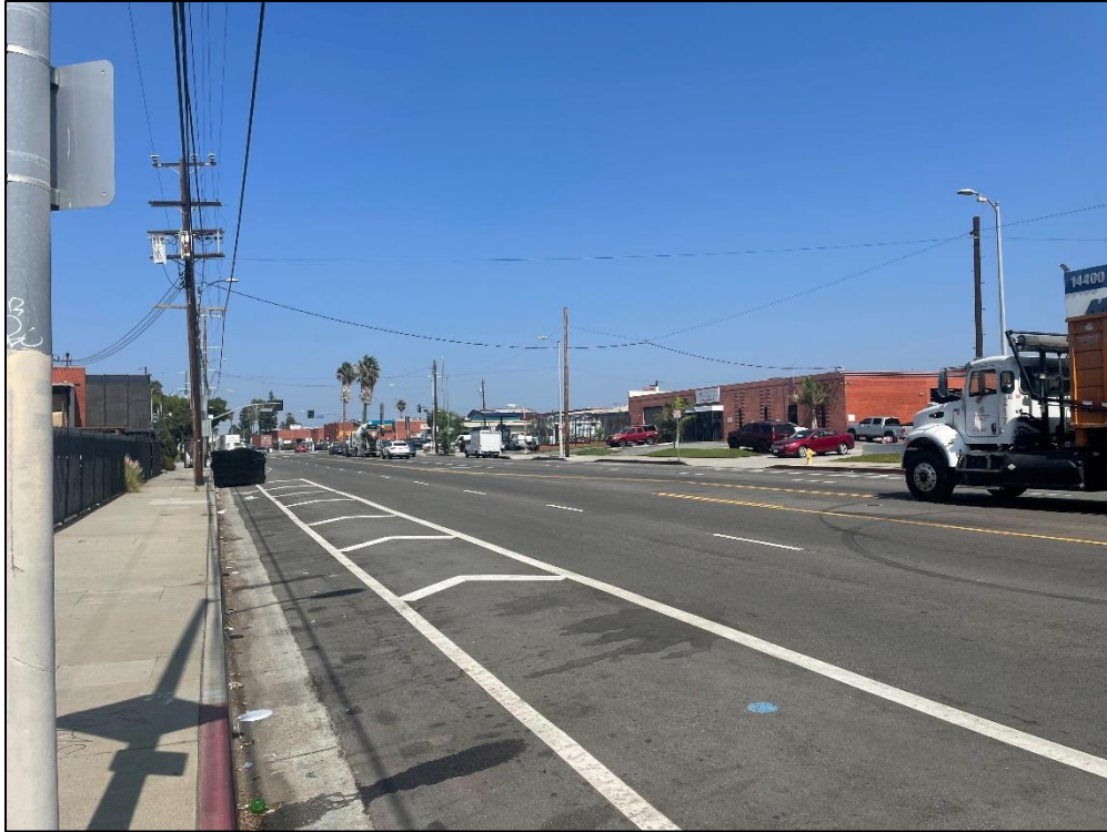
3. Facing north along Figueroa Street

Site Address: 14400 S. Figueroa St. & 400 Rosecrans Ave., Gardena, CA 90248