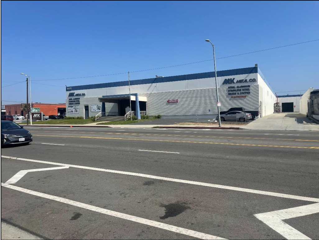
1. View of Project Site from Figueroa Street

Site Address: 14400 S. Figueroa St. & 400 Rosecrans Ave., Gardena, CA 90248