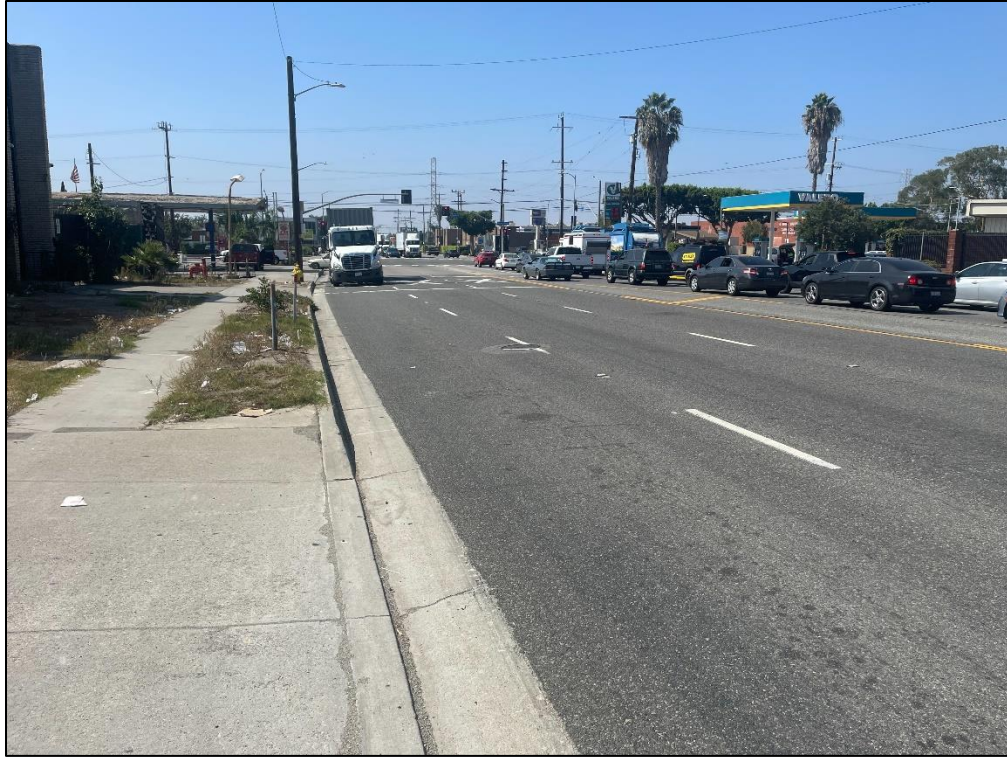
13. Facing west along Rosecrans Avenue

Site Address: 14400 S. Figueroa St. & 400 Rosecrans Ave., Gardena, CA 90248