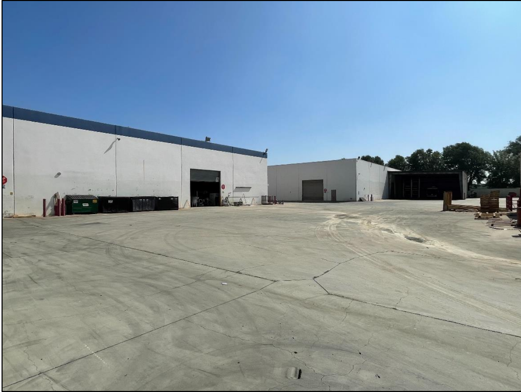
11. View of existing buildings at south end of Project Site (to be demolished)

Site Address: 14400 S. Figueroa St. & 400 Rosecrans Ave., Gardena, CA 90248