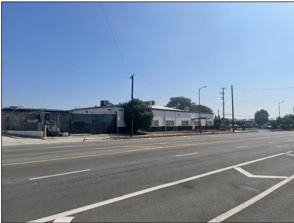
8. View of southerly adjacent property on Figueroa Street