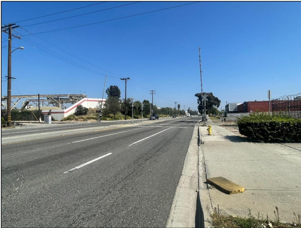
14. Facing east along Rosecrans Avenue