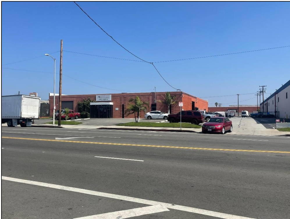
4. View of northerly adjacent property along Figueroa Street