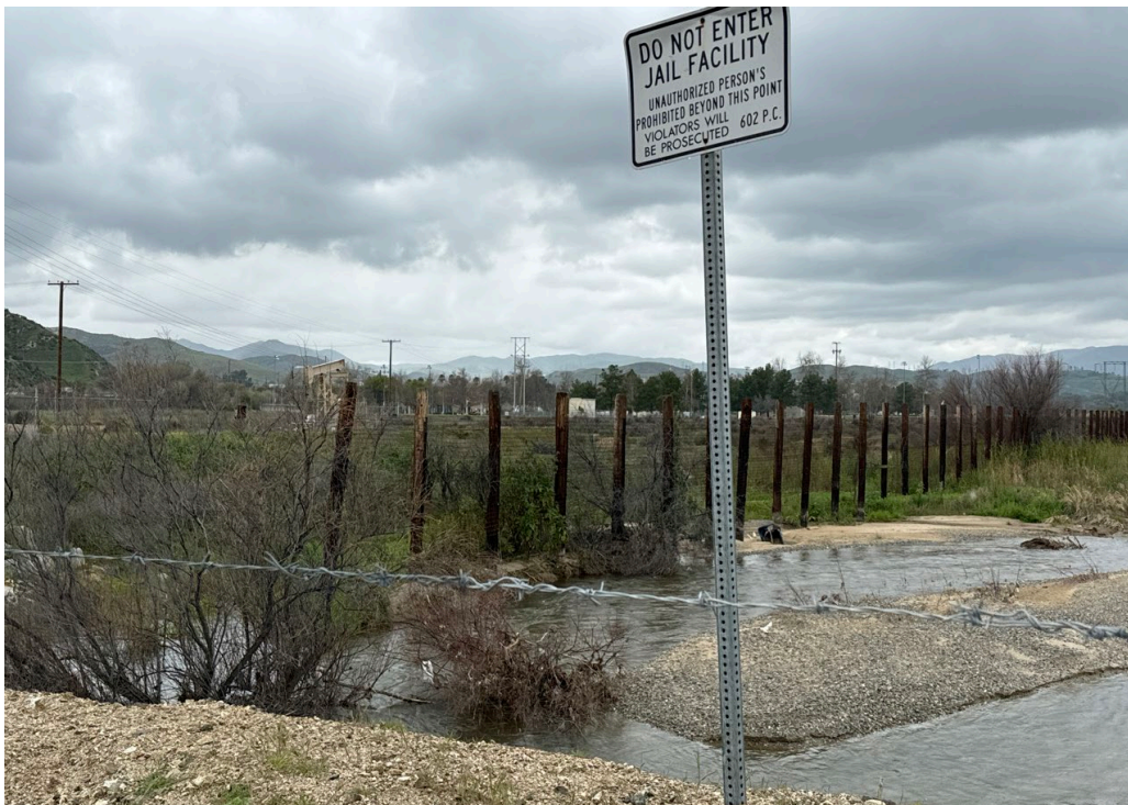
Photograph 6: View of Castaic Creek, facing northwest (upstream), at proposed off-site Tapia Canyon Road Bridge improvement area. Photo date: March 6, 2024