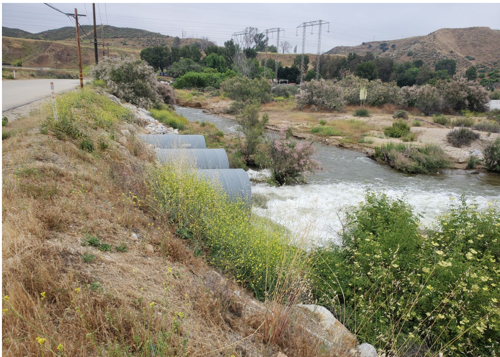
Photograph 10: East-facing view of the existing Tapia Canyon Road crossing and downstream culverts. Photo date: May 24, 2024