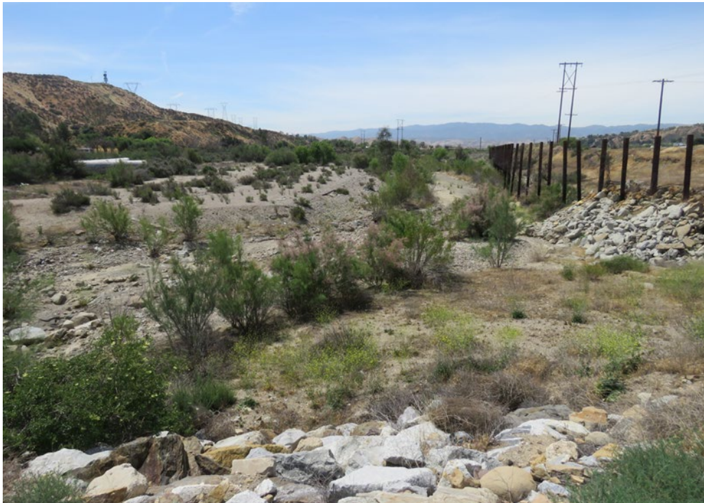
Photograph 1: View of Castaic Creek, facing south (downstream), at proposed off-site Tapia Canyon Road Bridge improvement area. Photo date: May 18, 2018