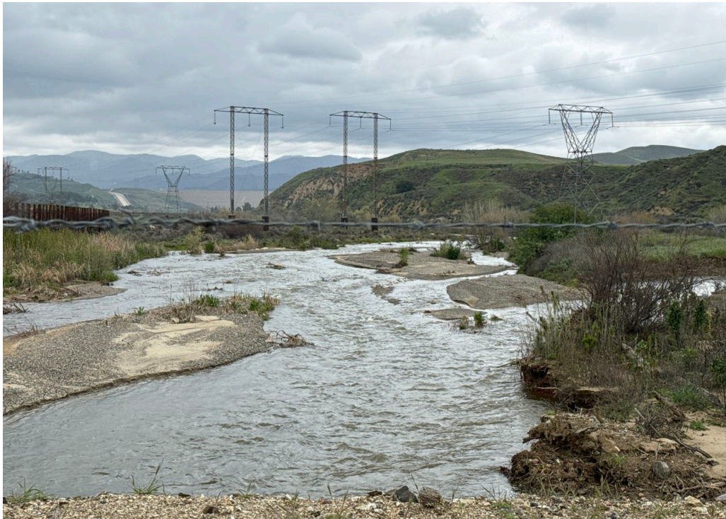
Photograph 3: View of Castaic Creek, facing north (upstream), at proposed off-site Tapia Canyon Road Bridge improvement area. Photo date: March 6, 2024