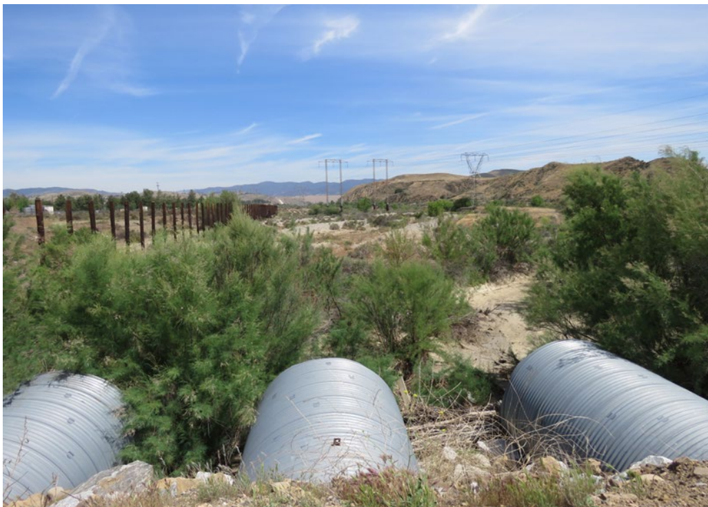
Photograph 2: View of Castaic Creek, facing north (upstream), at proposed off-site Tapia Canyon Road Bridge improvement area. Non-native and invasive tamarisk ( Tamarix sp.) trees are the dominant plant in view. Photo date: May 18, 2018