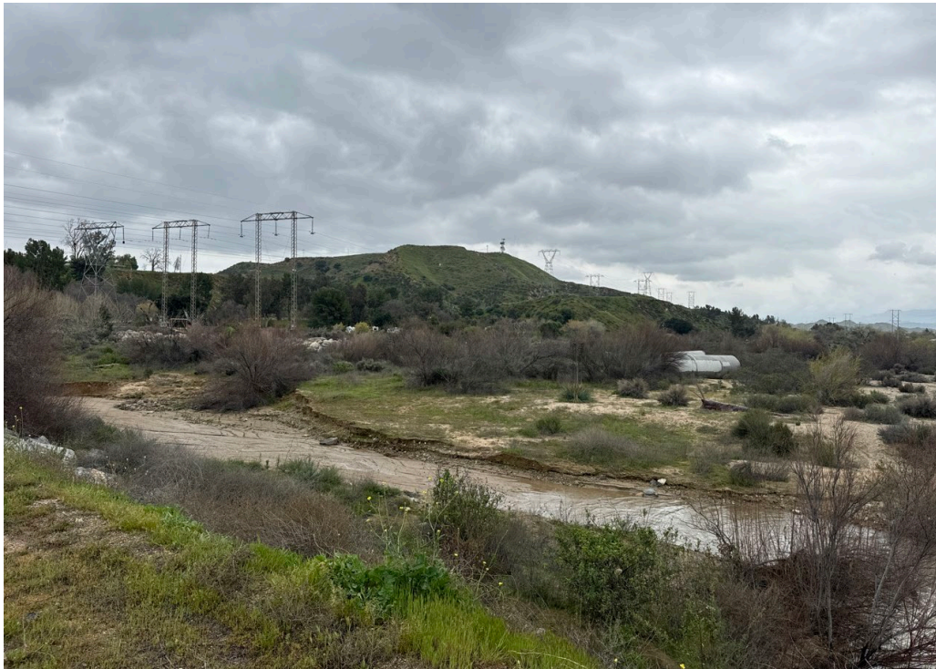
Photograph 9: View of Castaic Creek, facing southeast (downstream), at proposed off-site Tapia Canyon Road Bridge improvement area. Photo date: March 6, 2024