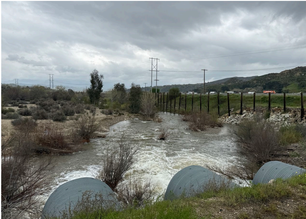
Photograph 7: View of Castaic Creek, facing south (downstream), at proposed off-site Tapia Canyon Road Bridge improvement area. Photo taken from existing roadway at same general location as Photograph 1. Photo date: March 6, 2024