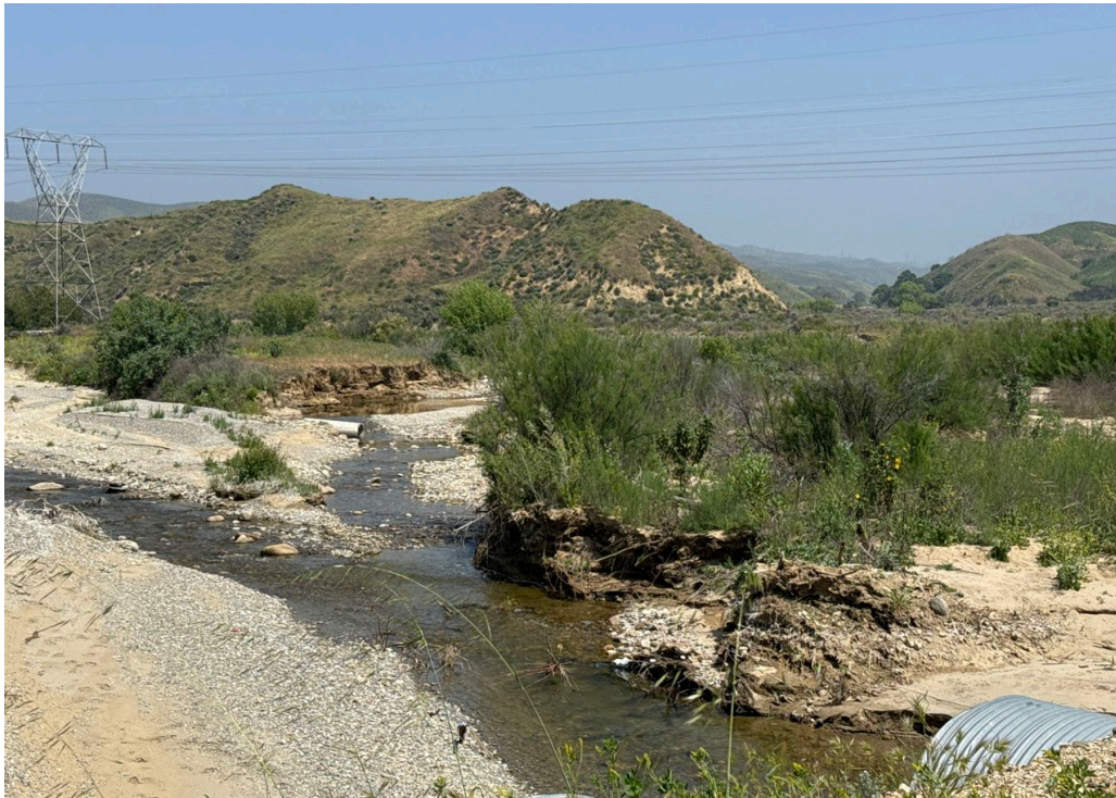
Photograph 5: View of Castaic Creek, facing northeast (upstream), at proposed off-site Tapia Canyon Road Bridge improvement area. Photo date: April 12, 2024