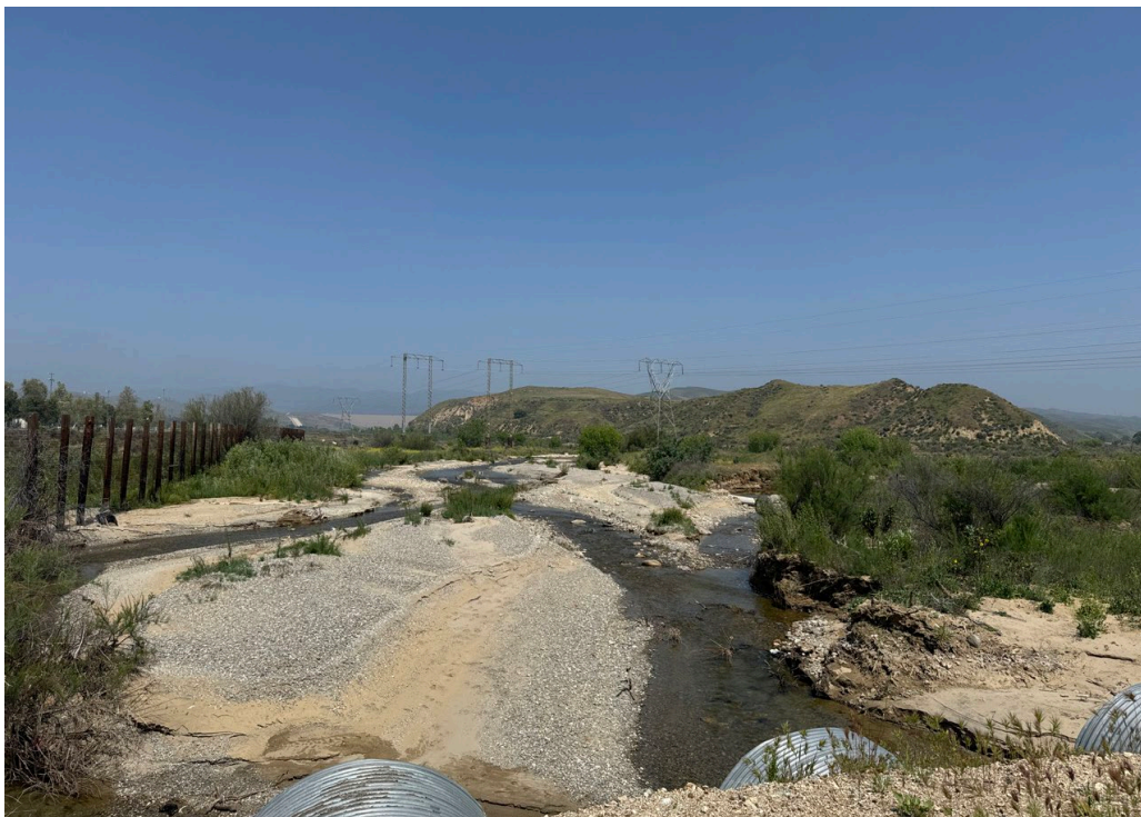
Photograph 4: View of Castaic Creek, facing north (upstream), at proposed off-site Tapia Canyon Road Bridge improvement area. Photo taken from existing roadway at same general location as Photograph 2. Photo date: April 12, 2024