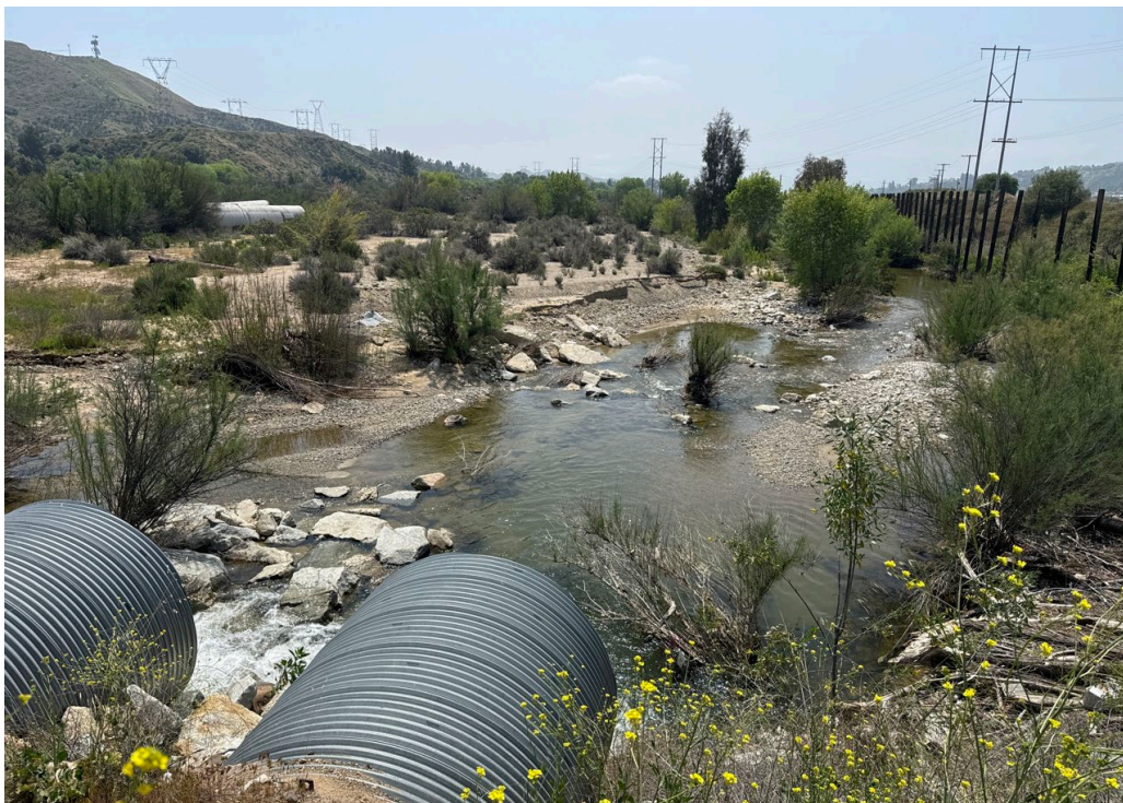
Photograph 8: View of Castaic Creek, facing south (downstream), at proposed off-site Tapia Canyon Road Bridge improvement area. Photo date: April 12, 2024